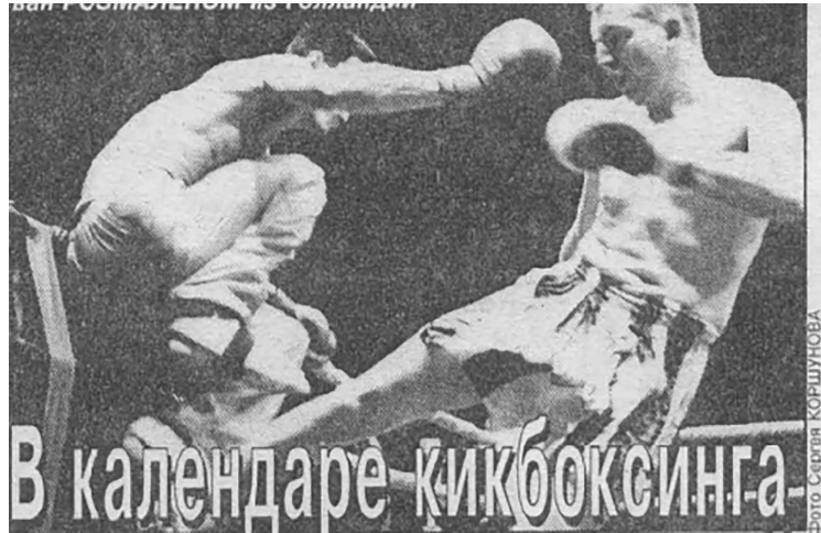
Figure 2. Example of an image with low printing quality

archiving. Such printing defects not only lead to the loss of visual detail but also significantly complicate the process of scanning and Optical Character Recognition (OCR) of accompanying texts and captions. Preservation practices for news media also record that paper brittleness and fragility are precisely key barriers to safe access and digitisation, as preliminary conservation is necessary before reformatting/scanning (Hutchison, 2024).